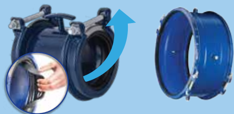
50mm - 300mm Flip gasket