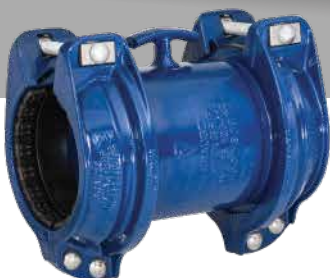
HYMAX 2 Flip Gasket

Krausz HYMAX wide range coupling solutions feature advanced engineering and innovative design, enabling fast installation, outstanding flexibility, and extreme durability in varied conditions. These benefits make the Krausz HYMAX the high-performance, cost-effective choice for a broad variety of applications. An advanced product that set a new industry standard, the Krausz HYMAX product line has been field-proven in millions of installations worldwide.